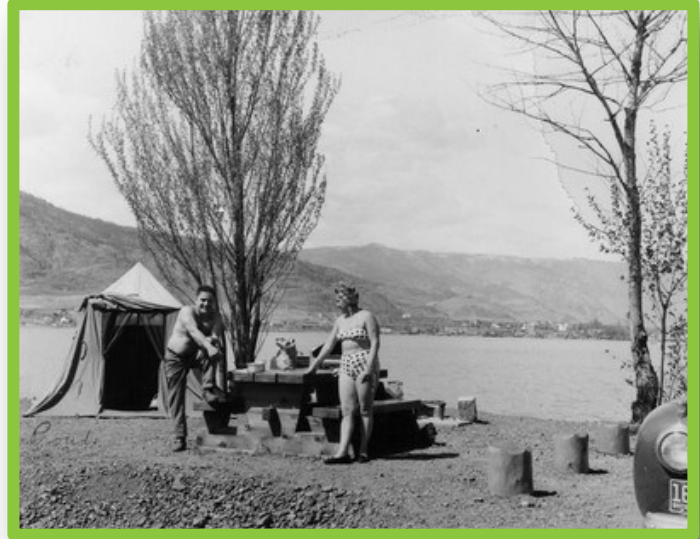
The first campers to use swiws (Haynes Point) Provincial Park April 1962

Osoyoos Museum Society Annual General Meeting Saturday, May 24 3-5pm at the Museum