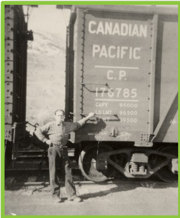
CPR train car carrying the last shipment of concentrates from the Dividend Mine March 1940