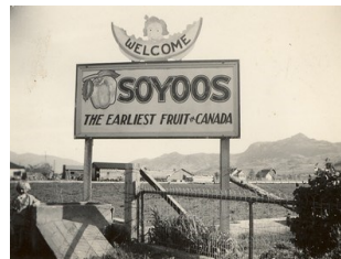
Welcome to Osoyoos sign 1953

complete this project has been amazing. Now we're moving forward with changing exhibits, new events, and more community involvement.