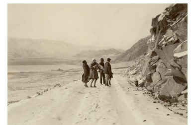
Winter on Anarchist late 1920s

Mark your calendars—Saturday, December 14, 10am-3pm.